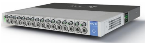
High-End FC-Stack End-of-Line Testing: AVL X-ION™ with Excellent Background Noise