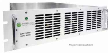
Greenlight GI Perturbation Unit